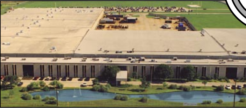
North America Headquarters & Manufacturing Facilities (Houston, TX)