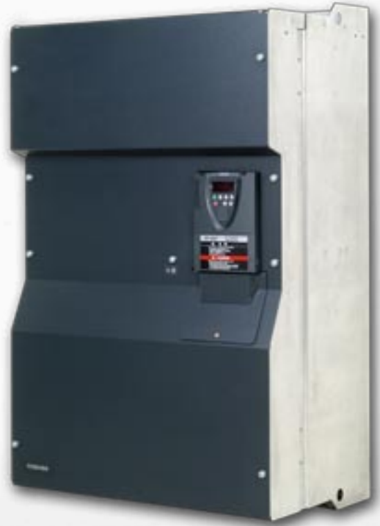
Large Horsepower AS1

The AS1 is certified by a broad range of governing and regulatory bodies making it a truly global product.