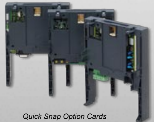
Quick Snap Option Cards

The AS1's new PID algorithm makes it easier than ever to dial in your process control application. New parameters, such as a delay filter and a process control lower limit, and new functions, such as the AS1's new Speed PID and easy positioning algorithms, give the drive expanded capabilities to take on difficult applications.